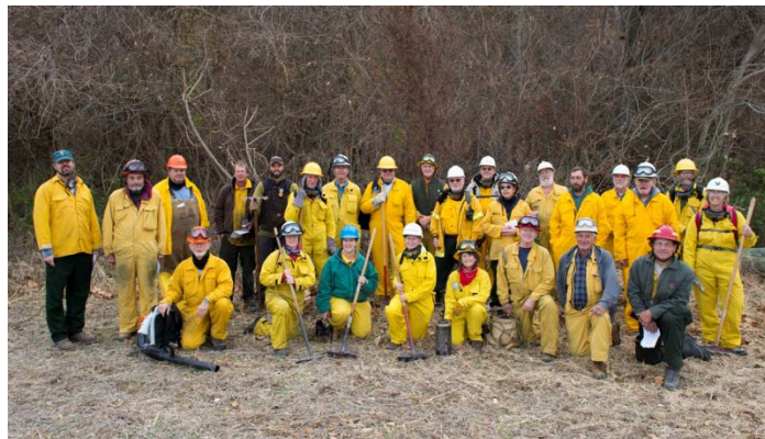
Volunteer Fire Crew

Monroe County, the 115-acre Mill Creek Natural Area in Randolph County and the 535-acre Paul Wightman Nature Preserve in Monroe County. Volunteers that get involved with CLIFFTOP can expect to help with prescribed burns, brush clearing, trail maintenance, control of invasive plant populations, and, with special permits, collecting seed for and restoring native plant