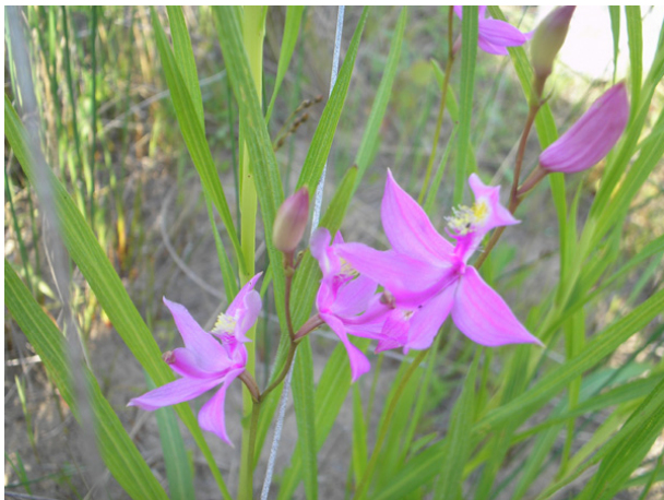
Grass Pink Orchid ( Calopogon tuberosus )

Plants of Concern (POC), launched in 2001, is a rare plant monitoring program designed to gather standardized, regional monitoring data over time to learn population trends in relation to management practices. The program is a collaboration of trained volunteer